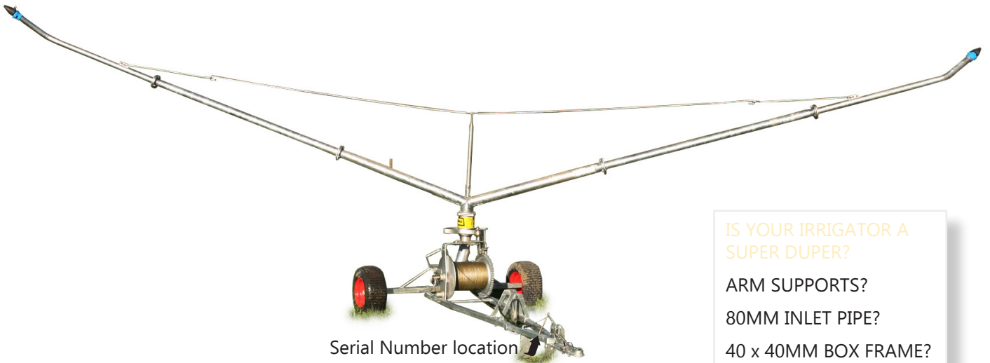
Serial Number location