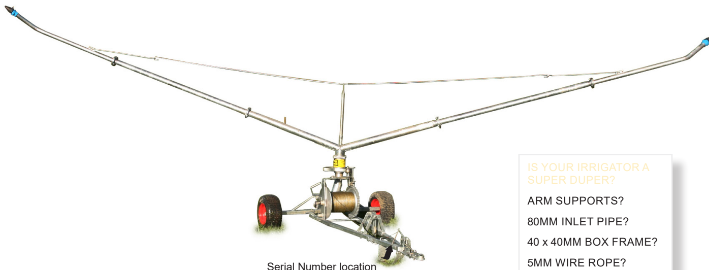
Serial Number location