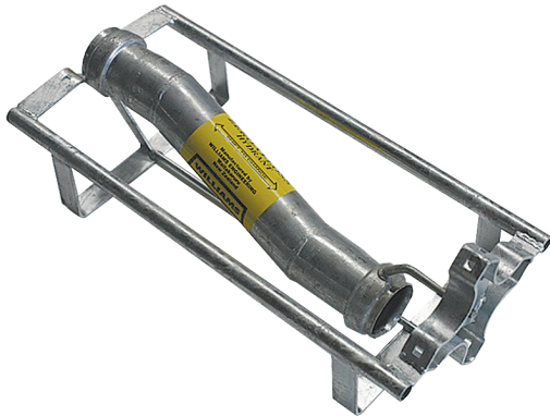
MODEL 3" Basic Unit (Hydrant) Includes H3 and 2 x H2

All hydrant fittings have a H4 and 2 x M10 x 30 Cuphead Bolt and Nut included.